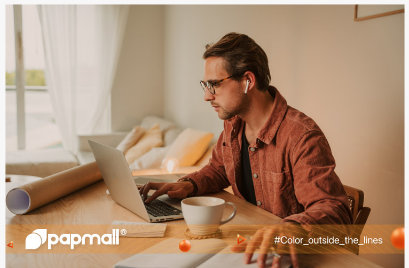
papmall® is taken as a worldwide platform