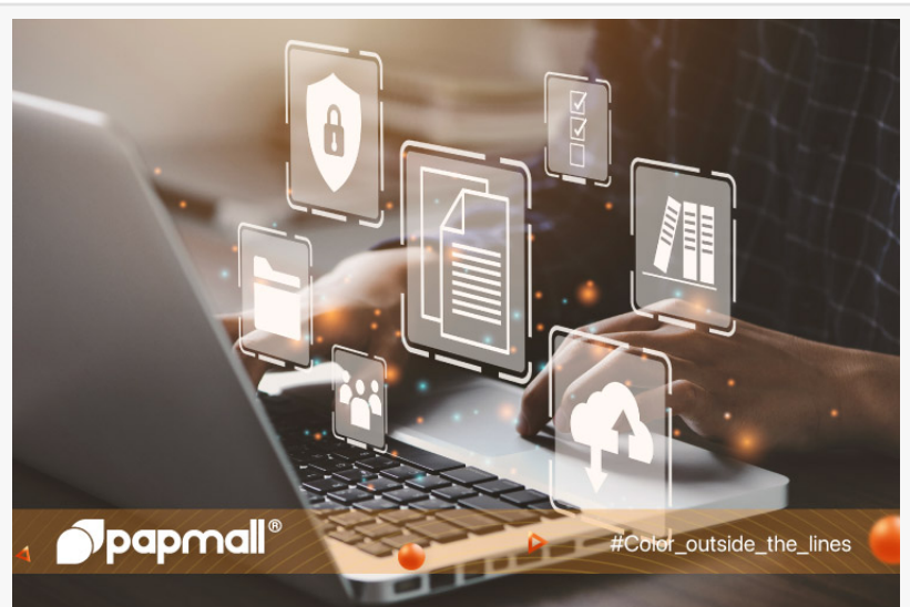
papmall® debuts 571 digital service categories

papmall® is ready to provide strategic leadership as the global partner for enterprises and independent contractors. Due to its involvement in the program, education, and the resources, real-world experience, and assistance required to expand its business in a competitive global