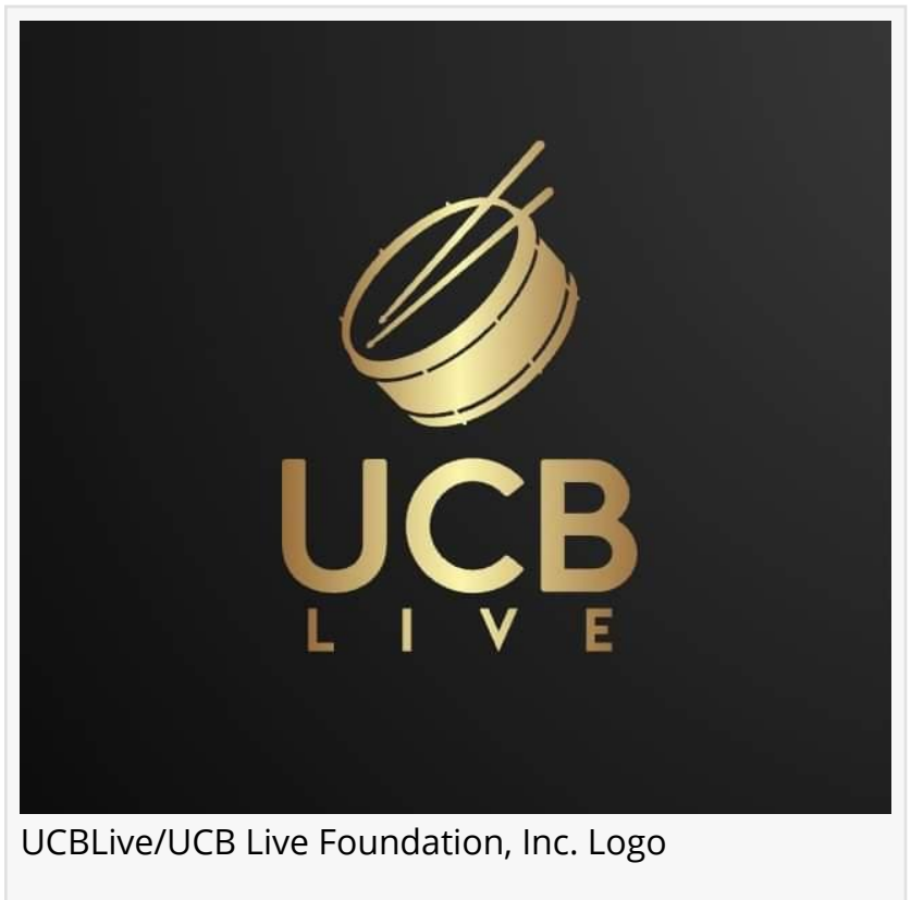
UCBLive/UCB Live Foundation, Inc. Logo