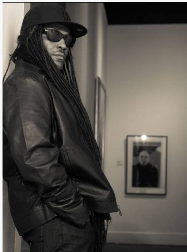
MC Holy Ghost - Rap Artist / Producer / Entrepreneur / Activist