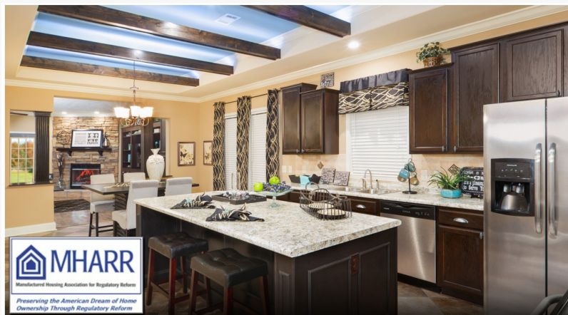
Photo above is of a Modern HUD Code Manufactured Home Produced by a MHARR Builder-Manufactured Housing Association for Regulatory Reform.