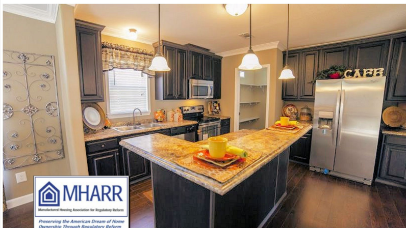
Another Modern HUD Code Manufactured Home Produced by MHARR Builder. Manufactured Housing Association for Regulatory Reform is a national trade group based in Washington, D.C.