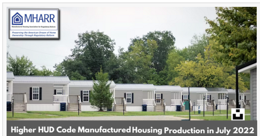
Higher HUD Code Manufactured Housing Production in July 2022

Once monthly, MHARR issues a national new manufactured home report that cites official data collected on behalf of federal officials. That same report also provides a running tally of the top ten states in the U.S. for manufactured home shipments. That hub or category on the ManufacturedHousingAssociation.org website is found at the link below.