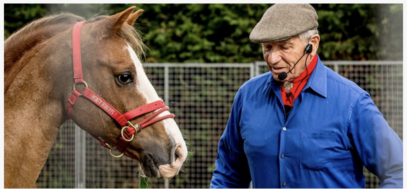
Monty Roberts Teaches Join-Up