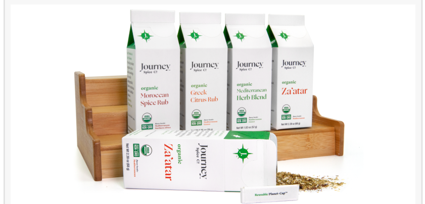
Journey Spice Co. products