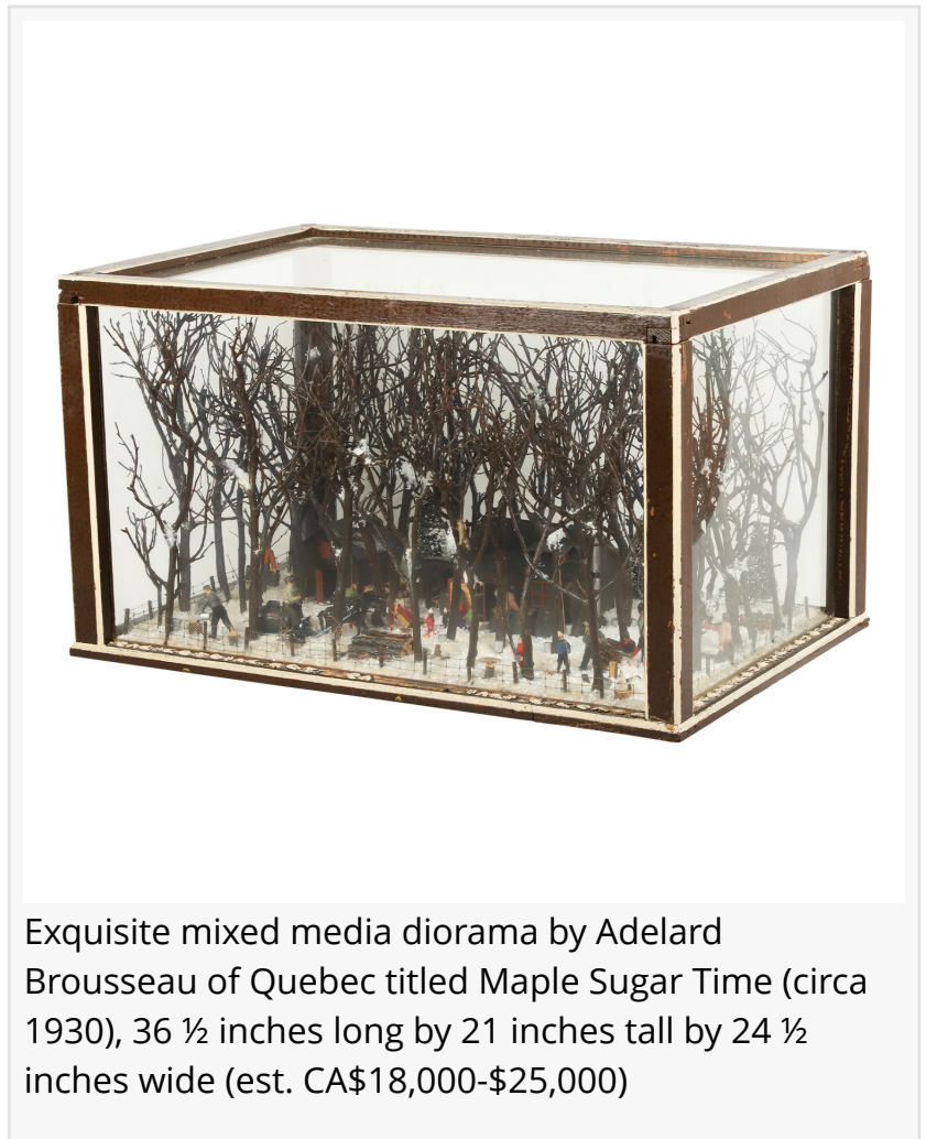
Exquisite mixed media diorama by Adelard Brousseau of Quebec titled Maple Sugar Time (circa 1930), 36 ½ inches long by 21 inches tall by 24 ½ inches wide (est. CA$18,000-$25,000)

There are eleven Maud Lewis paintings in the auction, with Winter Sleigh Ride an expected top earner, having a pre-sale estimate of $20,000-$25,000. The lovely, circa 1955 mixed media on beaverboard is a delightful and early Christmas season scene, similar to a later image used for a series of Canadian postage stamps. The 9 inch by 11 inch board (less frame) is signed and dated.