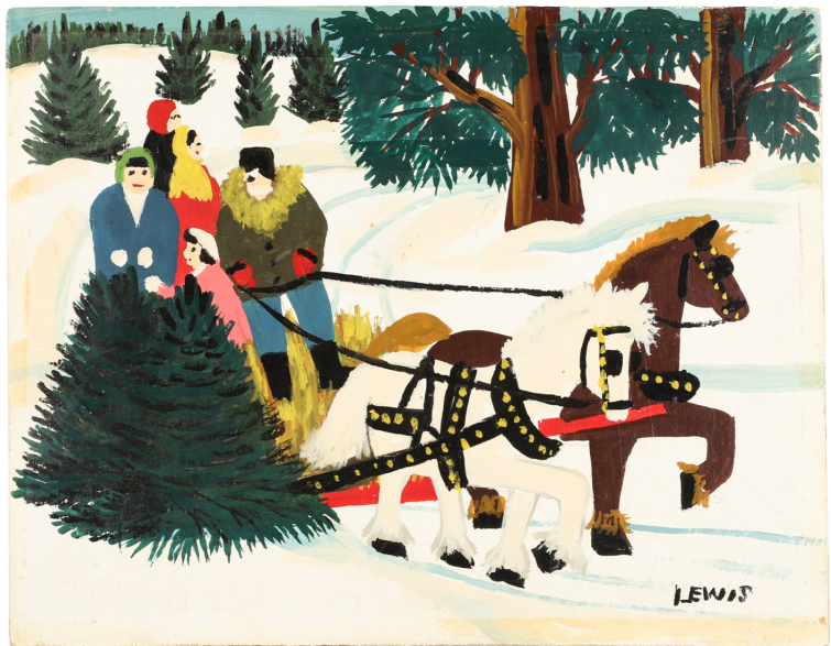
Mixed media painting by acclaimed Canadian folk artist Maud Lewis (1903-1980) titled Winter Sleigh Ride, 9 inches by 11 inches (less frame), signed and dated (est. CA$20,000-$25,000)