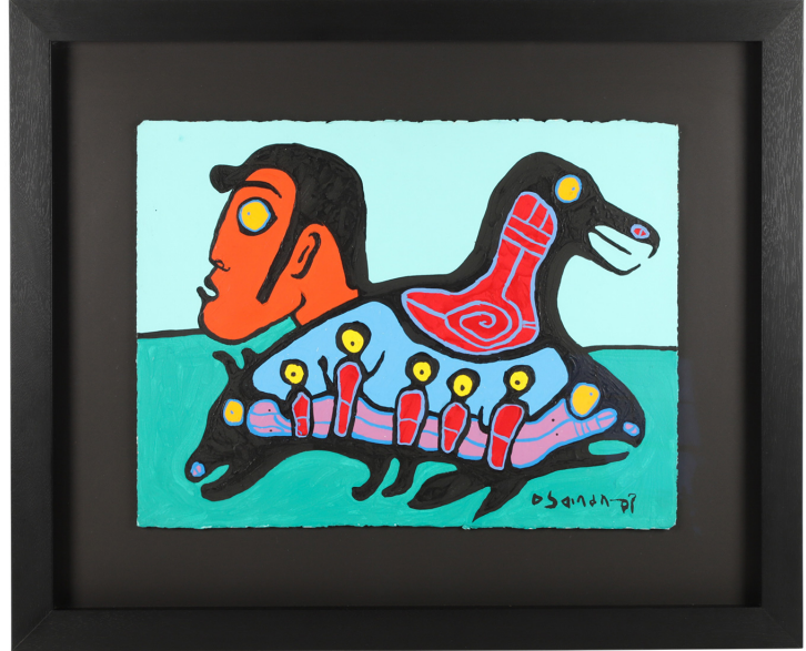
Acrylic on paper by Canadian Woodland artist Norval Morrisseau (1932-2007) titled Ancestral Visitors, signed lower right, 22 inches by 30 inches (less frame) (est. CA$12,000-$15,000)