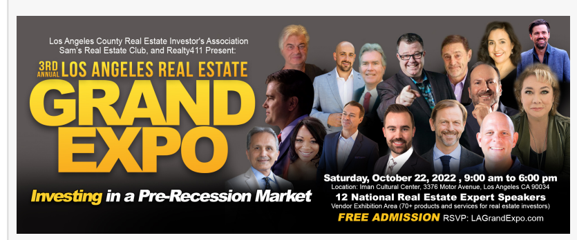
Banner for Grand Expo

This press release can be viewed online at: https://www.einpresswire.com/article/592278017