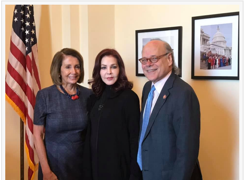
Rep. Steve Cohen discussing horse protection issues with House Speaker Nancy Pelosi and Priscilla Presley in January of 2019

EINPresswire.com/ -- On Wednesday afternoon the U.S. House Committee on Energy and Commerce passed the Prevent All Soring Tactics (PAST) Act, H.R. 5441, by a vote of 46 to 9 in a markup that will now advance the measure and ready the bill for a House floor vote. The legislation was introduced by Rep. Steve Cohen, D-Memphis, in the fall of 2021.