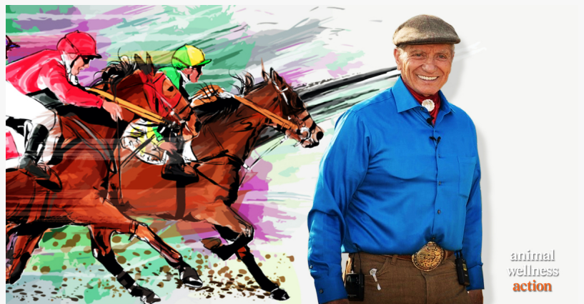
Monty Roberts