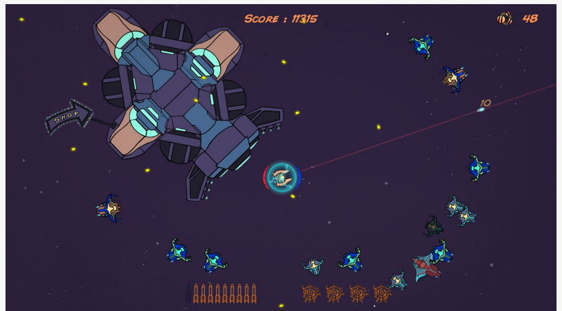
AST-Hero gameplay screenshot