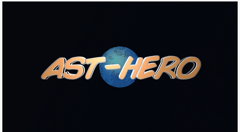
AST-Hero logo with black background

AST-Hero takes you on a journey through space where you control a small spaceship. You must defeat increasingly strong enemies and unique bosses. To succeed, you will need various upgrades that you will find in the Moebius inspired shop spaceship: weapon upgrades, shield upgrades... you can even buy some extra-luck. Powerups are also available and feature a super-powerful weapon. Five difficulty levels and an endless playing environment were designed to provide a gameplay experience filled with fun and excitement! A voiced starting tutorial, as well as a progressively increasing difficulty, give AST-Hero a perfect learning curve for a flawless experience.