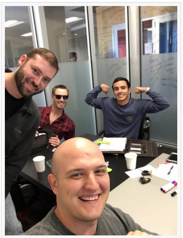
PRYME Home Solutions team

San Antonio homeowners interested in selling their houses to PRYME Home Solutions can contact them directly at +1 210-807-7071 or visit their website and read <u>PRYME Home</u> <u>Solutions reviews</u>.