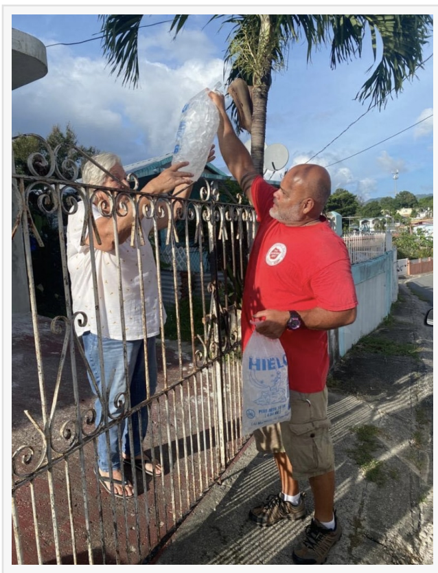
Salvation Army Puerto Rico Hurricane Fiona Relief Work

Additional services and items provided at some Salvation Army community centers include: