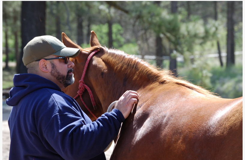
A veteran connected with a mustang

EINPresswire.com/ -- War Horse Creek is honored to announce it has received a grant from the Disabled Veterans National Foundation (DVNF) for $15,000, which will fund veterans' participation in War Horse Creek's Collaborative Horsemanship Workshops to help them through their transition from military to civilian life.