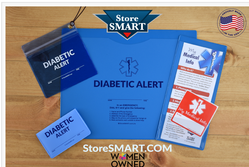
The Diabetic Alert Program

Each Health Alert style can be custom printed, making it an excellent informational and