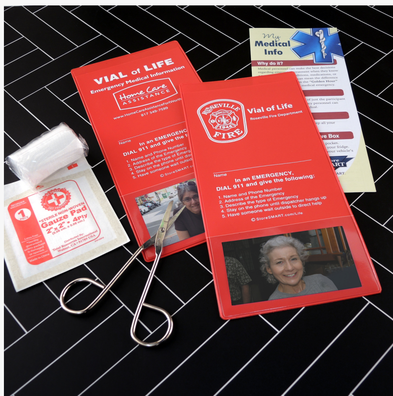
Custom Printed Vial of Life