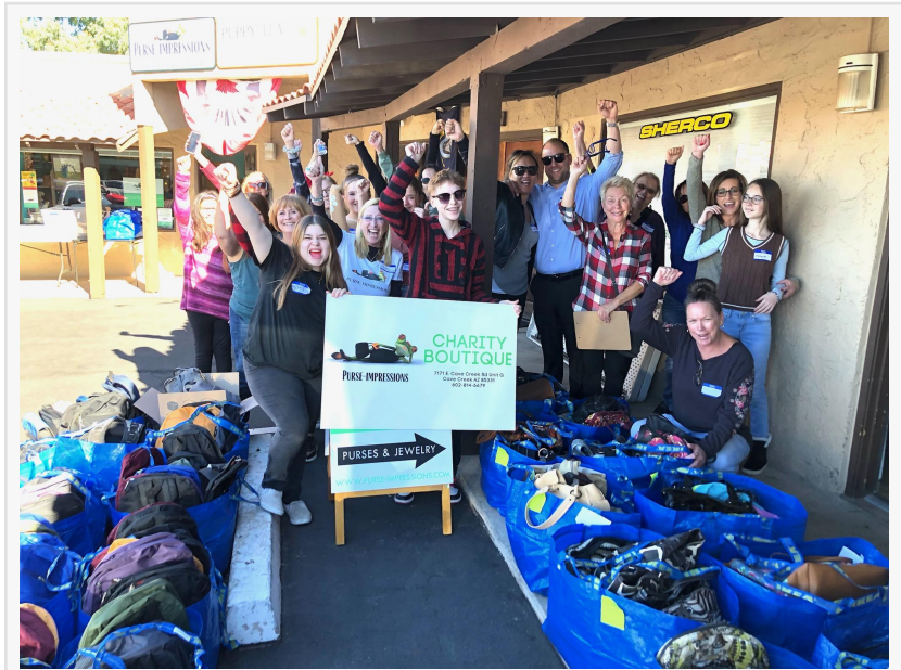
Purse- Impressions Holiday Donation 2021

Items needed are new or gently used purses, backpacks and to fill bags, travel size toiletries, hygiene items, makeup, jewelry, socks, journals, as well as, children's toys, coloring books and crayons and candy or snacks. Monetary donations are also acceptable and appreciated. All donations are eligible for a tax receipt.