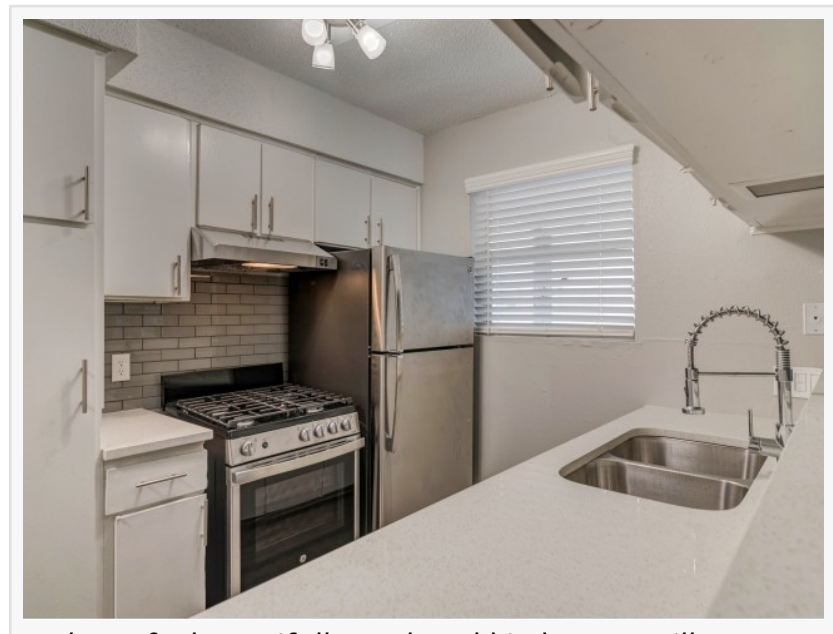
A shot of a beautifully updated kitchen at Miller Square.

Life at Spanish Trails includes an art deco pool, a 24-hour laundry facility, and is pet-friendly. Life at Miller Square includes a pool courtyard, bbq picnic area, and onsite laundry facility. Both properties are located just minutes away from Downtown Austin which includes easy access to highway I-35. With convenient access to these areas, all residents can enjoy an ample amount of options in regards to shopping, dining, live music, theater, bars, and more. Families can take advantage of being in close proximity to Mueller Lake Park, Thinkery Museum, and Blue Starlite Urban Drive In.