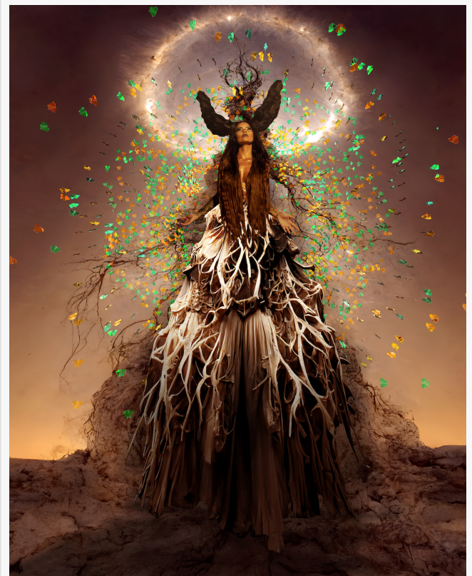
AZTRO: The Language of Signs "TAURUS"