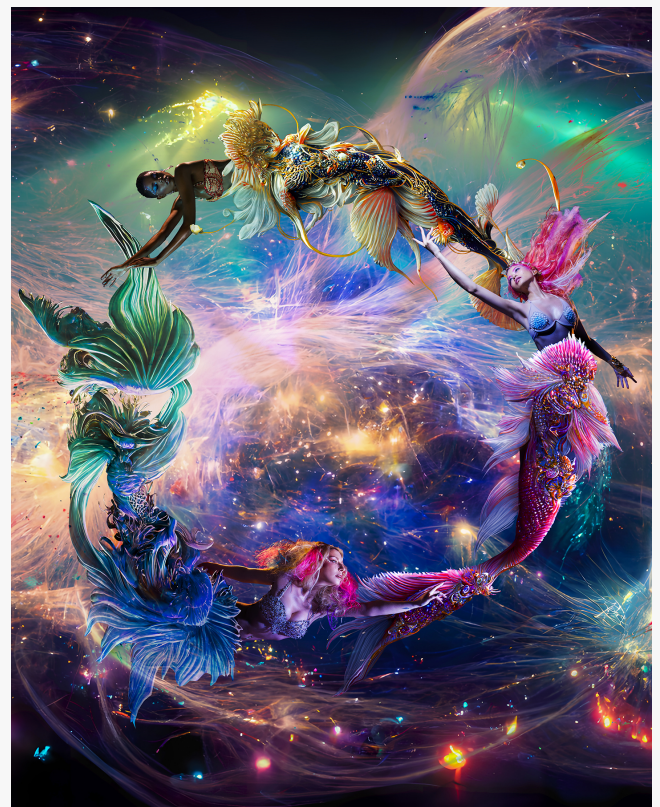
AZTRO: The Language of Signs "PISCES"