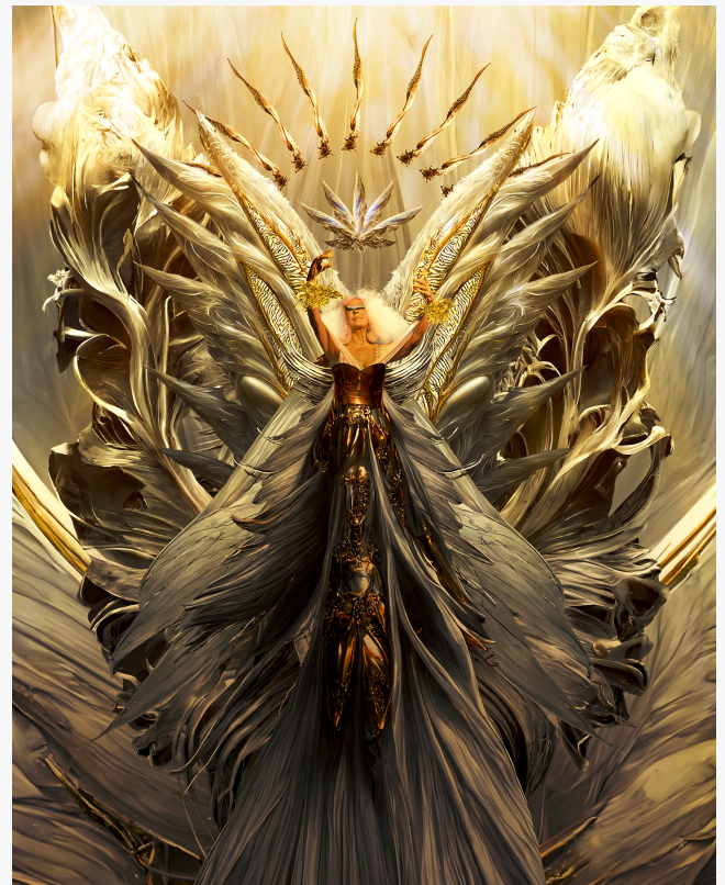
AZTRO: The Language of Signs "LIBRA"