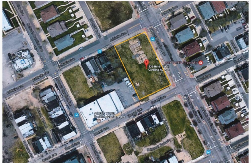
8 Lots in Multi-Family Zone

This press release can be viewed online at: https://www.einpresswire.com/article/592490221