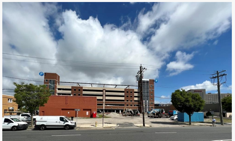
0.7+/- Acre Lot with Bldg CBD Zone

ATLANTIC CITY, NJ, USA, September 23, 2022 /EINPresswire.com/ -- Max Spann Real Estate and Auction Co. is pleased to announce the Auction of eight residential and commercial properties in Atlantic City . The properties, which are owned by the New Jersey Casino Reinvestment Development Authority ( CRDA ), will be sold in an Online Auction concluding Thursday, October 6, 2022. Bidders may bid on their computer or through the Max Spann app.