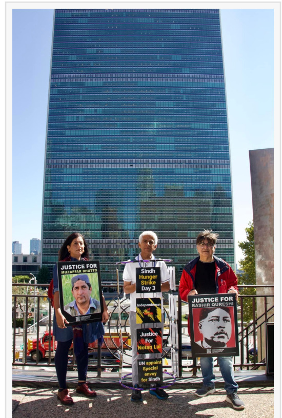
Sindh Hunger Strike and Protest in front of UN

"Under hegemony and genocidal atrocities by Pakistan and its military, Sindh is a serious humanitarian crisis and human rights issue. Sindhi Youths and political dissidents are enforcedly missing, whose whereabouts are unknown for years as no one knows whether they are dead or alive, our Sindhi daughters are abducted and forcibly converted to Islam by religious extremists and Jihadi groups, flood victim are left stranded in water and under open skies with no help from Pakistani government. Sindhis in today's Pakistan are treated like Bengali people were treated by the same Pakistani military and its junta in former East Pakistan, now Bangladesh. So for us, the Sindhis, have no other way out but to opt for the right of self-determination and free Sindh from