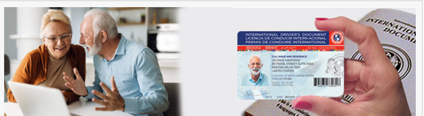
international driving permit

International Driving License is not just a piece of paper & it will make your traveling safe, and secure and most of all give you a piece of mind. This not only makes individuals drive safely on the road. US Government provides perks and privileges to get the International Driving License. International Driving License preserves the nationals, and at the same time, makes them capable of driving anywhere safely.