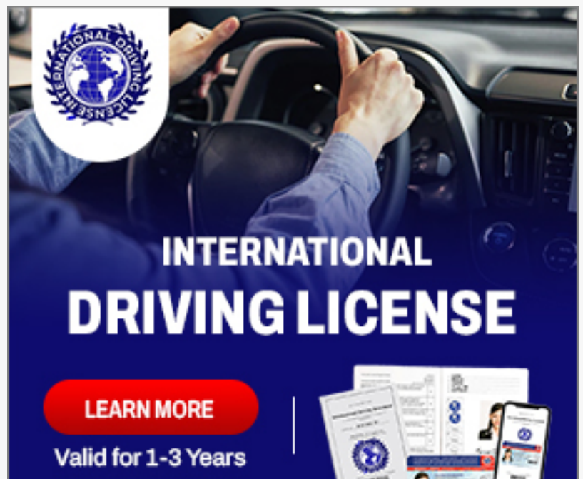
International Drivers License