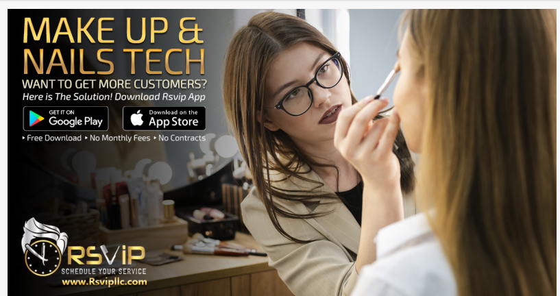
rsvip make up app