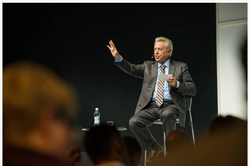
OmegaPro super-trainer Maxwell is a Legend of Leadership

According to Maxwell, values vary from person-to-person. It can be defined as the things one