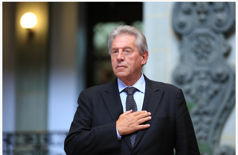
OmegaPro invites Maxwell for a training