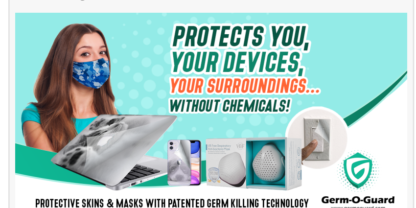
Germ-O-Guard protective skins are available for all types of portable electronic devices as well as switches, buttons and surfaces. Masks featuring the

Germ-O-Guard Protective Skins are available for smartphones, tablets and laptop computers, keeping them all germ free