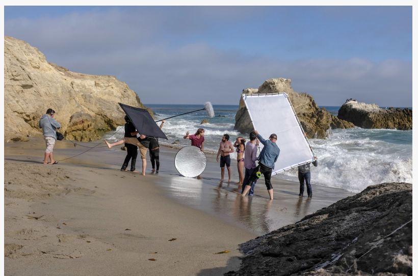
Filming Shellfish on Malibu Beach