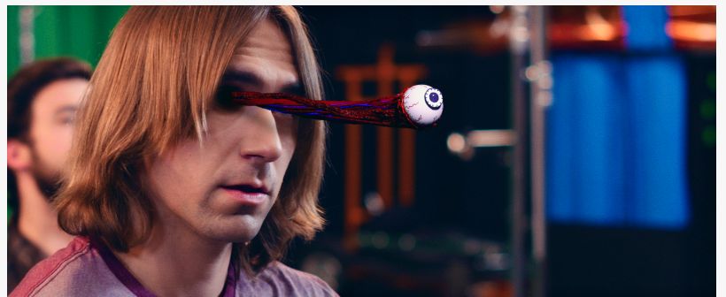
A Still Frame from Shellfish that Mixes Stop Motion with Live Action