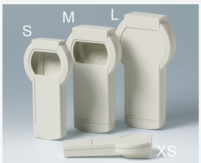
DATEC-CONTROL enclosures are available in four standard sizes.

Sean Bailey OKW Enclosures Inc +1 412-220-9244 email us here