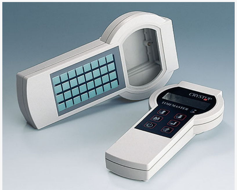
DATEC-CONTROL enclosures are designed for large graphics displays and keypads.

This press release can be viewed online at: https://www.einpresswire.com/article/592817793