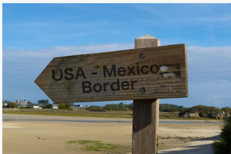
US Mexico Border Sign

The ongoing issues at the borders are spreading across the nation. Instead of being limited to border states, human and drug trafficking are national issues. Under current policies, millions of immigrants attempt to enter the country each year. Officials at the border are often overwhelmed.