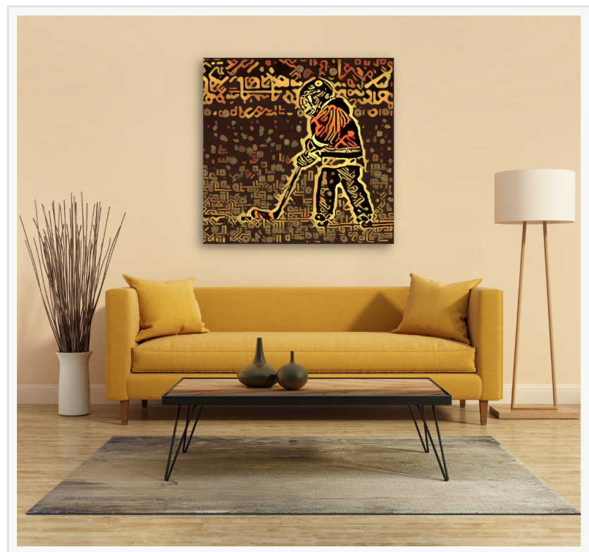
High resolution images are great for printing artwork too

Currently, the website offers users the option to download super high-resolution files of their work (big enough to be printed on a billboard), or order prints on a variety of mediums including canvas, posters and more. The site is the fastest on the market in generating art outputs, with no registration required, and no complicated software to download or learn. The company plans to continue to roll out more products as they expand. In addition to the consumerfacing platform, there are plans in the works for a robust, professional