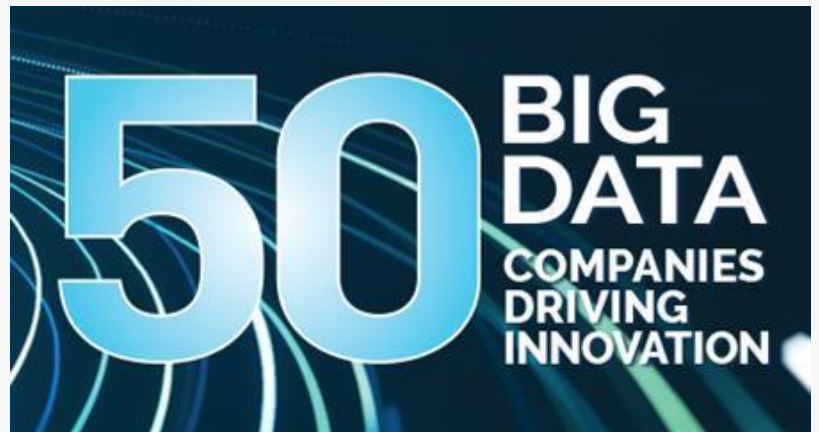
Franz Inc. - Big Data 50

EINPresswire.com/ -- Franz Inc. , an early innovator in Artificial Intelligence (AI) and leading supplier of Graph Database technology for Entity-Event Knowledge Graph Solutions, today announced it has been named to the "Big Data 50: Companies Driving Innovation in 2022" by Database Trends and Applications.