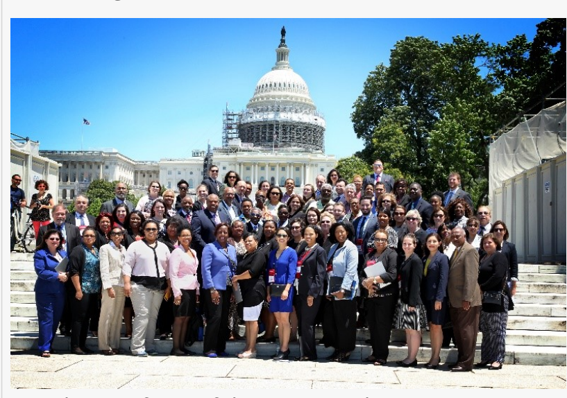
Members in front of the US Capitol

Under Law, where he spearheads the organization's cutting-edge racial justice work in education and leads a team representing college students of color and alumni defending affirmative action admissions plans in three separate cases filed against Harvard College, the University of North Carolina at Chapel Hill, and the University of Texas at Austin. In the Harvard case, he argued before the First Circuit Court of Appeals on behalf of student amici, helping to uphold Harvard's race-conscious admissions.