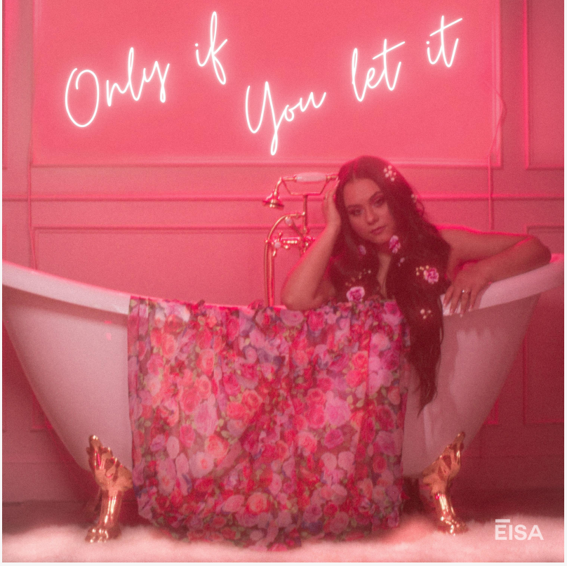
EISA - Album Art "Only if You let it"