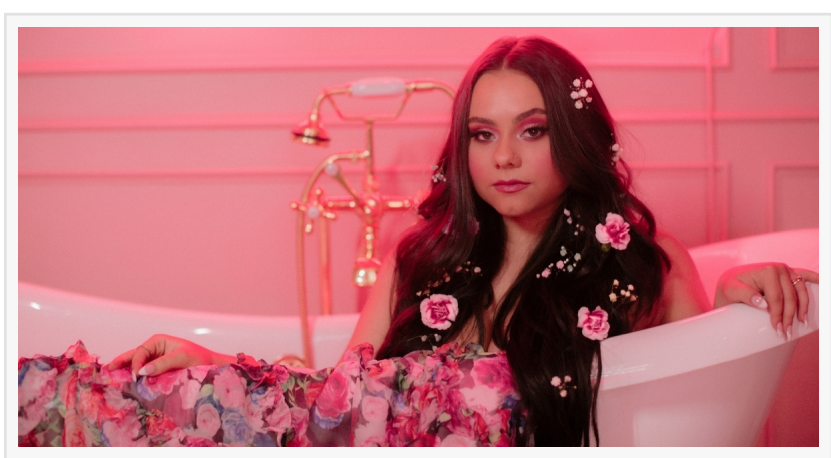
EISA - "Only if You let it"

LOS ANGELES, CALIFORNIA , USA, September 27, 2022 / EINPresswire.com/ -- For the past 2 years EISA has been in the studio writing, recording and gearing up to make an impact in the music industry with the highly anticipated release of her first ever original single, "Only if