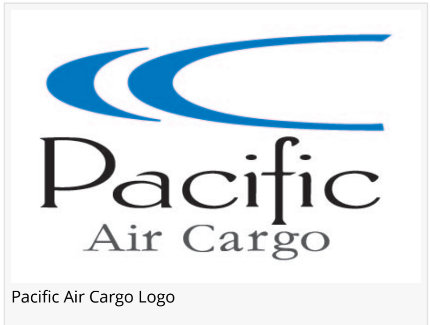
Pacific Air Cargo Logo

/EINPresswire.com/ -- Pacific Air Cargo (PAC) today announced the introduction of an extensive new Road Feeder Service (PAC RFS) which offers new gateways to and from both Hawaii and Los Angeles, linking selected locations throughout the lower 48 states and all main Hawaiian Islands. Initially 11 major gateway locations are being introduced, but others will progressively be added to offer Pacific Air Cargo partners and customers one of the nation's most extensive air-road feeder networks.