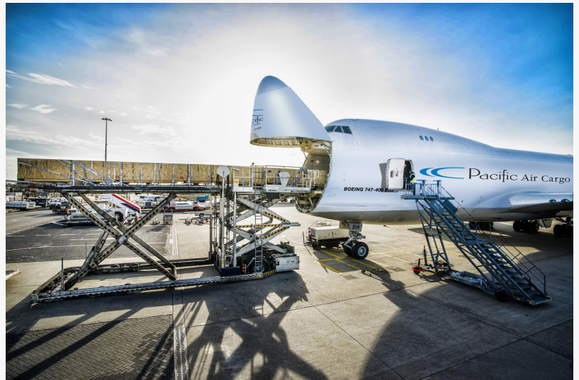
PAC Nose Loader