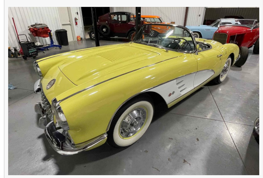
1958 Panama Yellow Corvette

Moreover, the event offers you the opportunity consign your car and sell to bidders from across the Country. For more information about consigning one car or your whole collection or the auction in general, please call Freedom Car Auctions (844.399.1050) or visit <a href="https://www.FreedomCarAuctions.com">www.FreedomCarAuctions.com</a>.