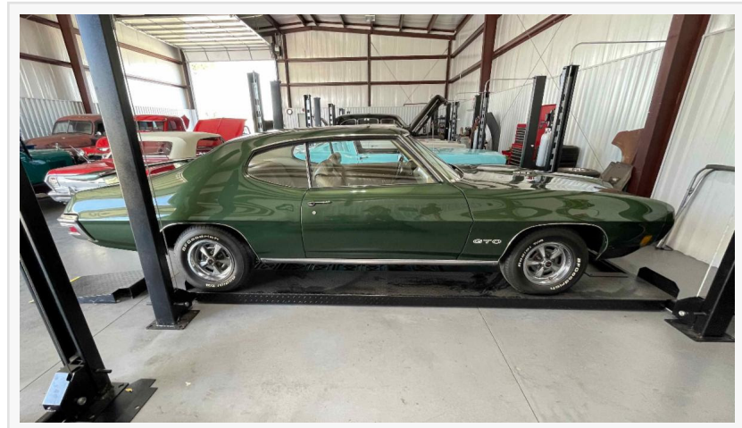
1970 Pontiac GTO Ram Air 4 Speed previously owned by country music legend Alan Jackson

announces that a 1970 Pontiac GTO Ram Air 4 Speed previously owned by country music legend Alan Jackson, a 1967 Chevy Corvette 427/400 Triple Crown Winner, a 1963 Chevy Nova, a 1967 Corvette, a 1958 Panama Yellow Corvette, a 1966 Mustang (38,000 Miles) and other vehicles have been added to the special interest car auction at the Choctaw Casino &