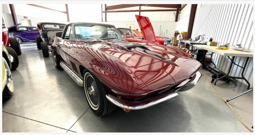
1967 Chevy Corvette 427/400 Triple Crown Winner