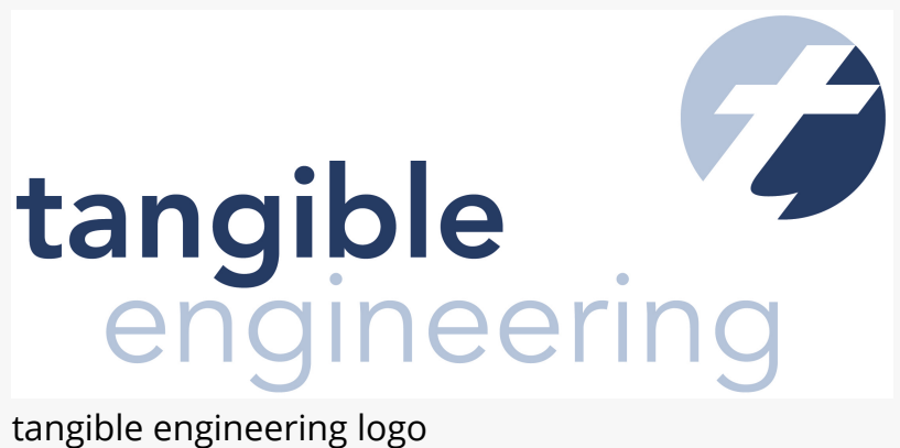
tangible engineering logo