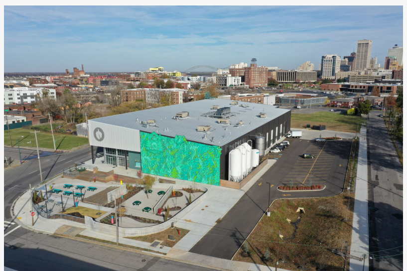
In 2020 WISEACRE built a state-of-the-art production facility in Downtown Memphis that nearly quintupled its brewing capacity.

WISEACRE will kick off its Illinois relaunch with events around town at Black Sheep, Sheffield’s and The Beer Temple, where WISEACRE placed second in their “Search for the Perfect Pilsner” blind tasting competition in 2020. Details for those events are as follows: