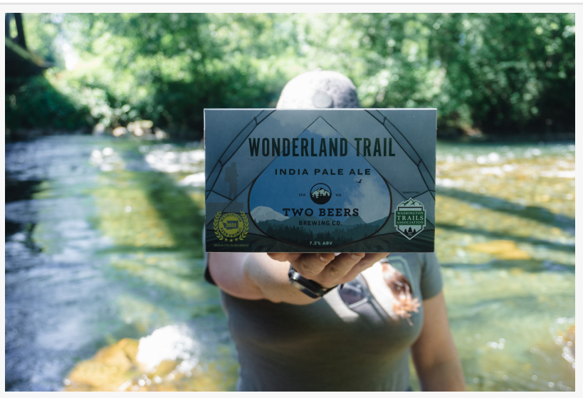
New Wonderland Trail IPA Box with Washington Trails Association Logo and WA Beer Awards Medal

Two Beers Brewing, a local Washington brewery located in Seattle's SODO