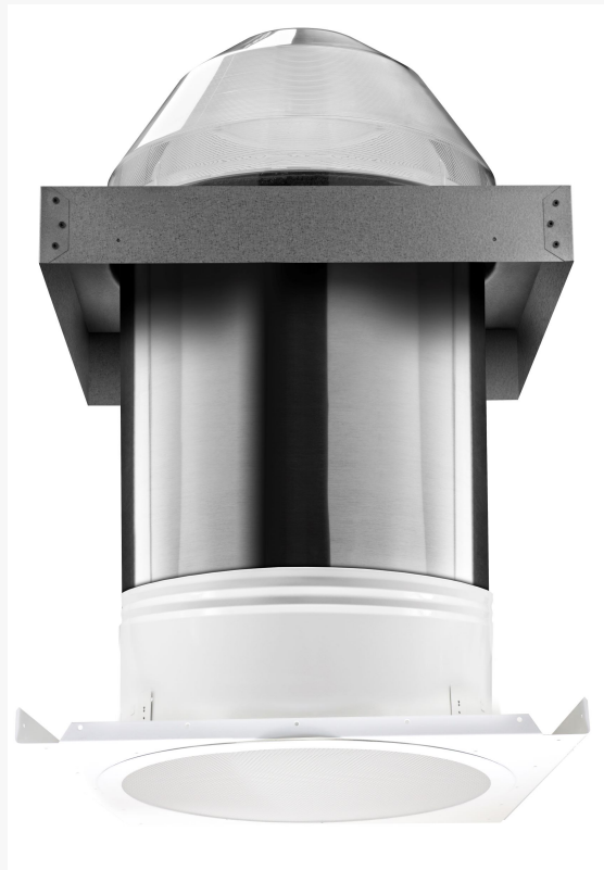
Fully assembled Solatube SolaMaster Daylighting System with Round Ceiling Fixture