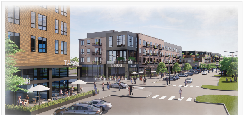
Rendering of The Crossroads of Northwest Ohio

“It’s great to see developments like Crossroads taking action and making moves towards their clean energy goals” says NXTGEN founder Russ Bates, who will be personally working with Crossroads in the upcoming months to create a clean energy plan that aligns with the architectural design goals while still providing affordable energy needs. NXTGEN was chosen as a