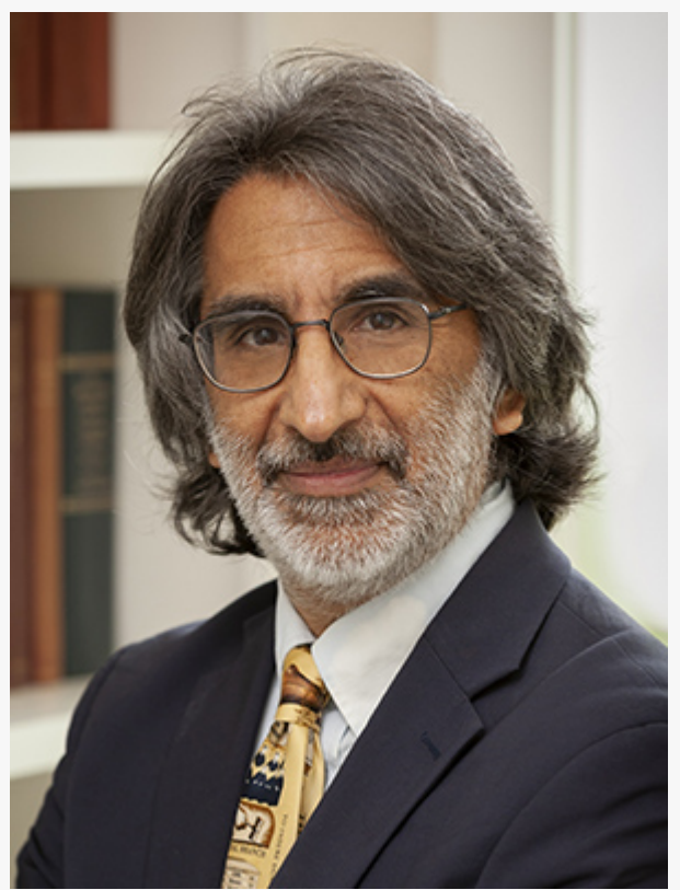
Professor Akhil Reed Amar, Sterling Professor of Law, Yale University