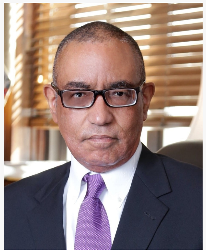
U.S. District Judge Myron Thompson

This press release can be viewed online at: https://www.einpresswire.com/article/593099863