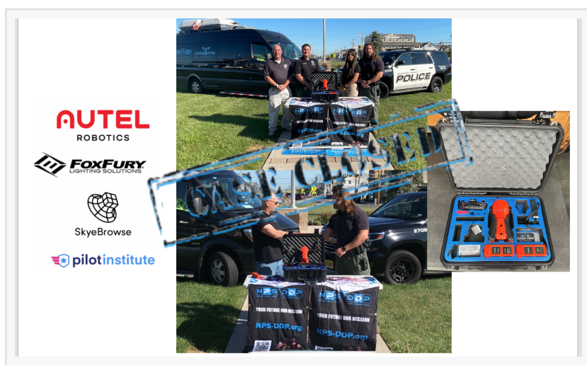
Drone donation number 43 Seaside Park police Department case closed

HEBRON, CT, UNITED STATES, September 30, 2022 / EINPresswire.com/ -- "In September of 2016, Seaside Park was the target of a terrorist bombing by Ahmad Khan Rahimi. Rahimi who was inspired by ISIS and al Qaeda planted an IED on our boardwalk, along the route for the Seaside Semper Five Marine Corps Charity 5K race. The start of the race was fortunately delayed, had the race