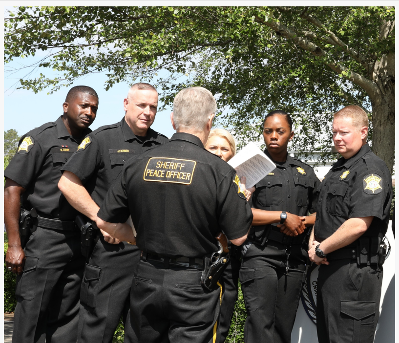
Richland County S.C. Sheriff Leon Lott instructs his deputies to be Peace Officers

Police2Peace sees this new training and certification as a simple, nationally scalable way to