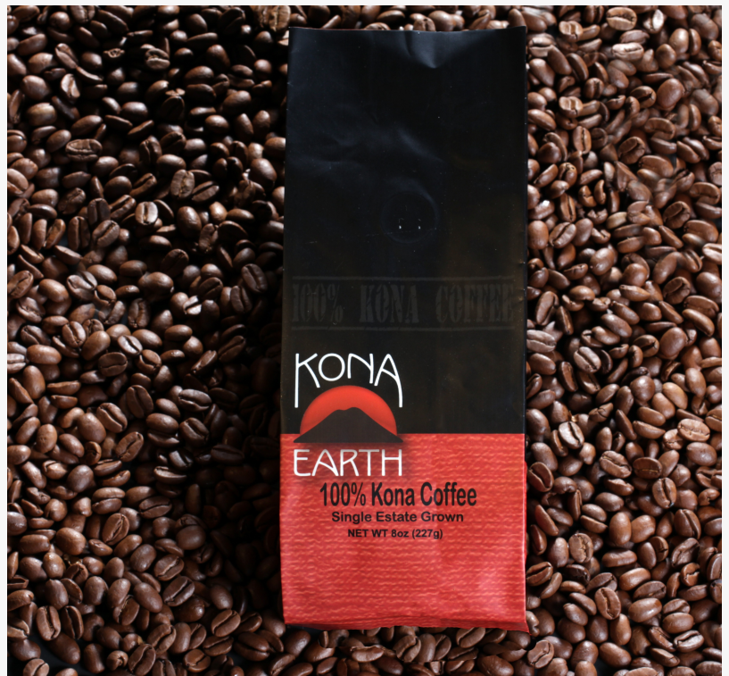
Kona Earth sells single-estate, 100% Kona Coffee micro roasted to perfection and shipped farm direct.

To take advantage of this offer, visit Kona Earth's website and select the Single Sample item .