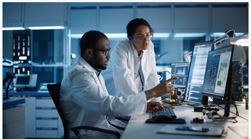
Global Laboratory Informatics Market

generate approximately $5.9 billion by 2028. In addition, the Laboratory Informatics Market is anticipated to record increases of around 10.1% between 2021 and 2028. Apparently, the growth of the laboratory informatics market over the assessment period can be credited to the surge in