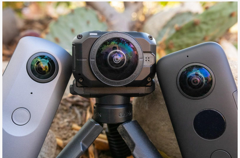
Global 360-Degree Camera Market Trends

NEW YORK, UNITED STATES, September 28, 2022 /EINPresswire.com/ -- The Global 360-Degree Camera Market Report Shows highly fragmented some of the prominent players including Samsung Electronics, YL Technology, LG Electronics, Ricoh, Kodak, PANONO, GoPro, Insta360, Digital Domain Production, 360fly, Immervision, Nikon, Rylo, Bubl, Xiaomi, Sony Corporation, Panasonic, Nokia Corporation, Ricoh Company Ltd, and Mistika VR. In this report, we will analyze the growth drivers, opportunities, and obstacles of the 360-degree camera market from 2022 to 2028.