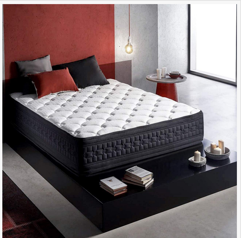
Global Mattress Market

The Asia Pacific, with two highly populated countries, China and India, is the most lucrative market for the sales of mattresses and is expected to dominate the global market over the