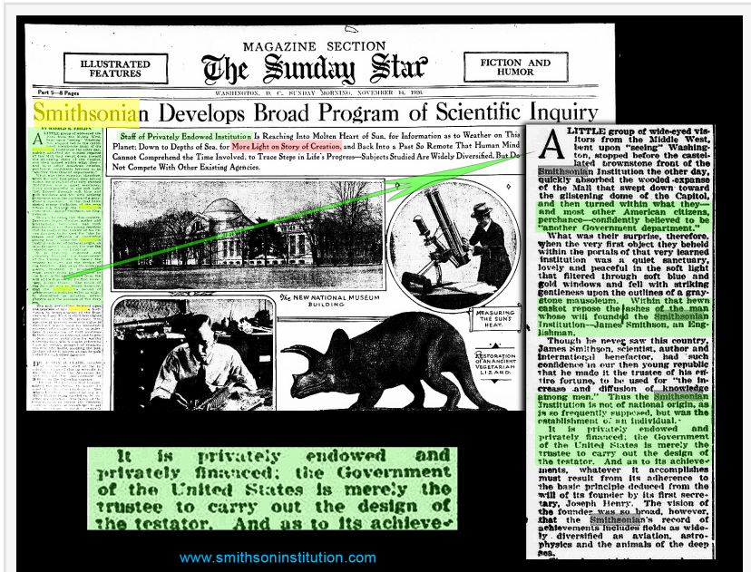
The Smithsonian Institution is a private charitable trust