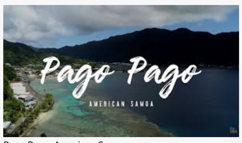
Pago Pago, American Samoa

Free IRS EIN Tax Number directly from IRS.GOV for your newly formed American Samoa LLC is available online