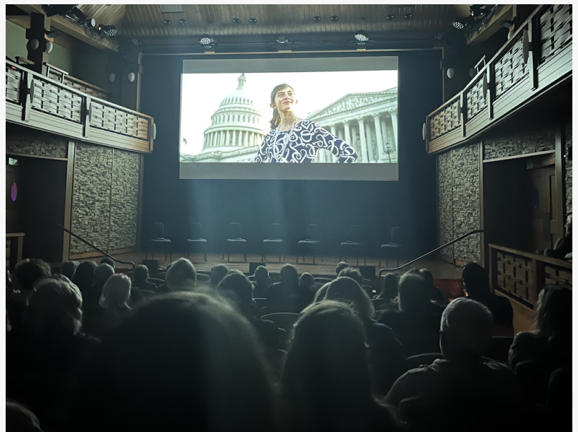
Shot of the film at the Boston Film Festival