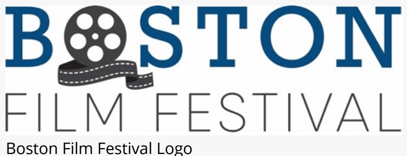
Boston Film Festival Logo