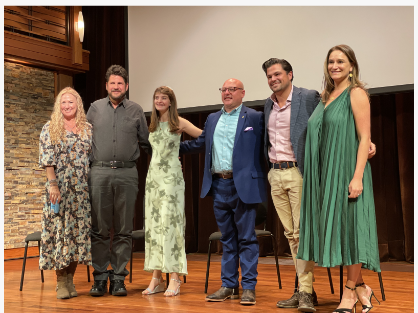
Wild Beauty Team at Boston Film Festival