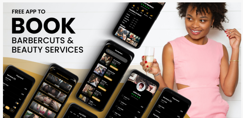
RSViP App on Google Play Store