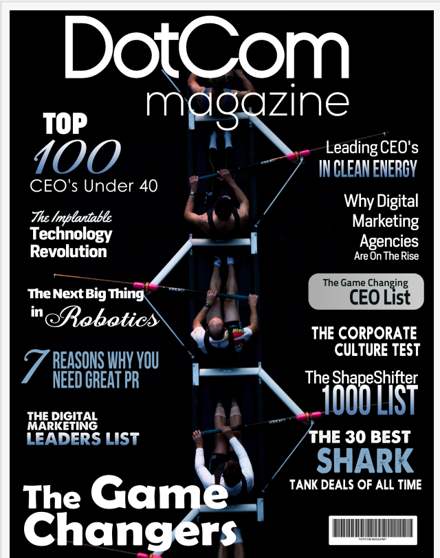
The DotCom Magazine Game Changers Edition