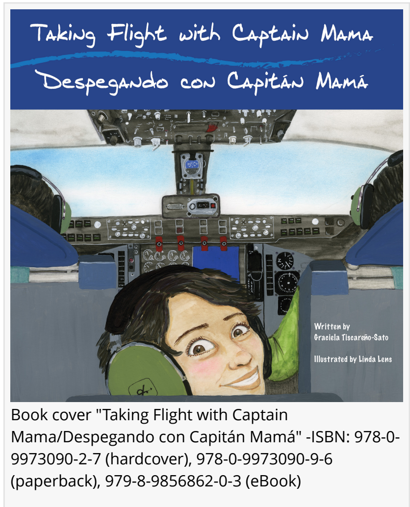
Book cover "Taking Flight with Captain Mama/Despegando con Capitán Mamá" -ISBN: 978-0-9973090-2-7 (hardcover), 978-0-9973090-9-6 (paperback), 979-8-9856862-0-3 (eBook)

“The “you are there” feel is heightened by action-packed experiences, aircraft communications and explanations, and discussions of military deployment that help the young narrator better understand his mother’s service, duties, and the special role she holds as a Captain on a military aircrew. Details about the stealth fighter jet educate kids about different types of military planes, while the adventure component keeps children both involved and educated.